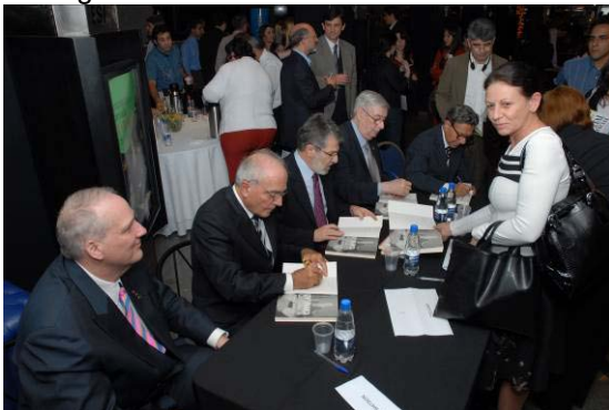
Book Signing for Academy Publications