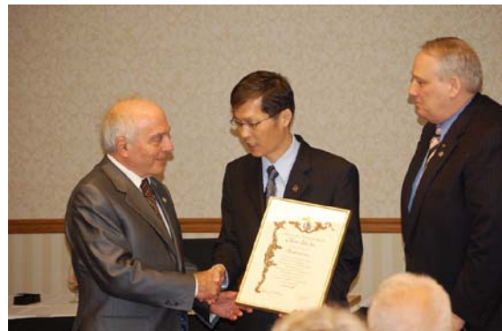
Academician Chao-Ton SU