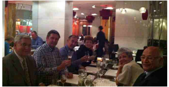
IAQ Dinner on 24th November 2012, at Hotel Shangrila, New Delhi.

Response from UNESCO has been positive. A meeting with UNESCO was happened on March 2012. Our application has been forwarded to their legal department. A Symposium on Quality in Education has been planned during the ANQ Congress scheduled in Hong Kong on August 3, 2012. Planning is to achieve an UNESCO consultative status by the end of the year 2012.