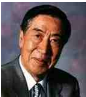
Dr. Genichi Taguchi January 1, 1924 – June 2, 2012

Dr. Genichi Taguchi died in Tokyo on June 2, 2012 at the age of 88. He had risen from humble beginnings to become one of the most influential people in Quality Engineering. He has made pioneering contributions to Japanese and US industry. His Quality Engineering methods consist of both off-line and on-line quality control techniques. In particular, Taguchi's methods for robust parameter design have had a profound impact on the way experimental techniques are used to address the core needs of engineering [Read more]