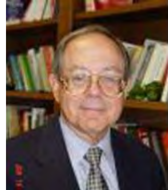
IAQ Academician Douglas C. Montgomery, ASQ Honorary Member