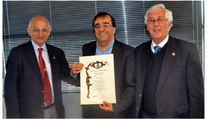
Academician Pedro Saraiva