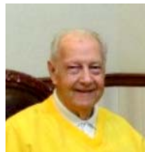
Academician Emeritus Ken Stephens Distinguished Service Medal